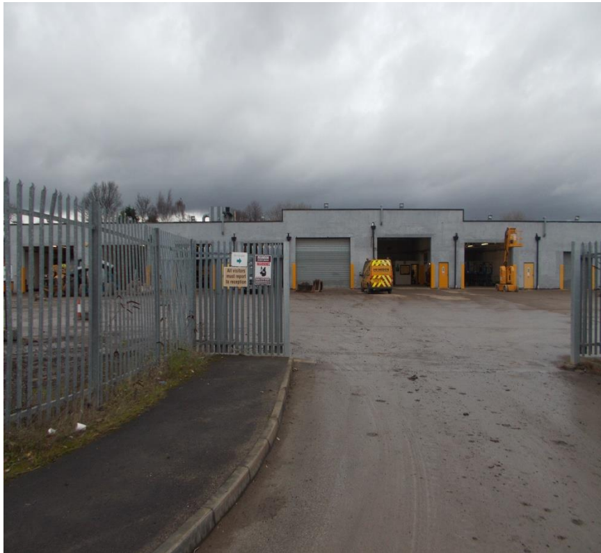
Bulwell 16 th December 2013